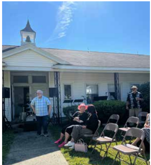
Praise Team setting up