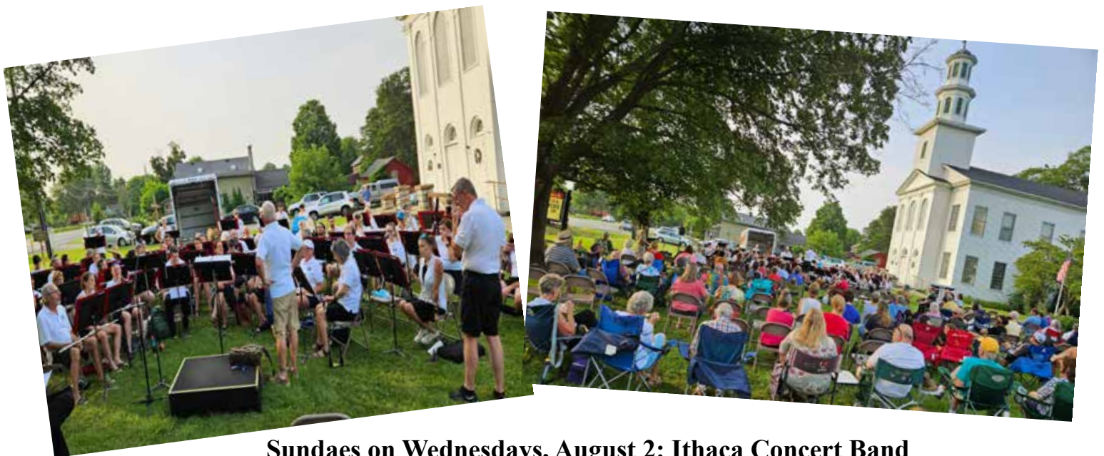
Sundaes on Wednesdays, August 2: Ithaca Concert Band