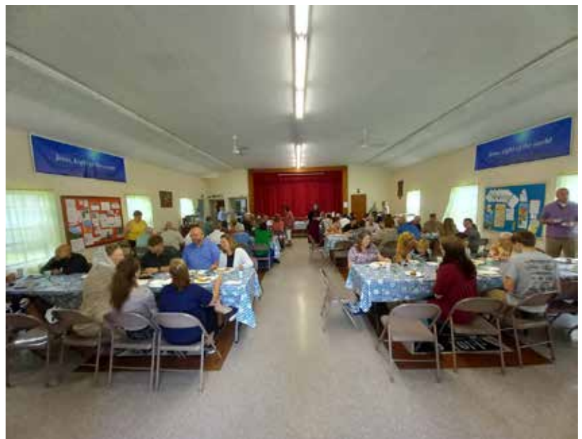
Father's Day Brunch with the Ukrainian Church