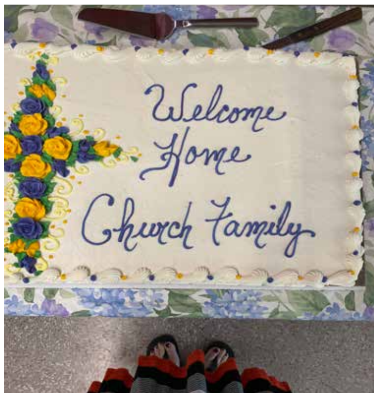
Welcome Back to Church Cake June 13, 2021