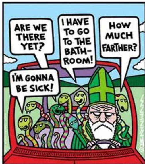
St. Patrick driving the snakes out of Ireland.

Church Development forces us to evaluate everything and to make decisive changes in the way we do life and ministry together to keep us vitally engaged in Jesus’ mission. Church Development helps prevent us from becoming internally focused and losing our missional edge over time.