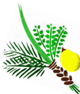
The Four Species