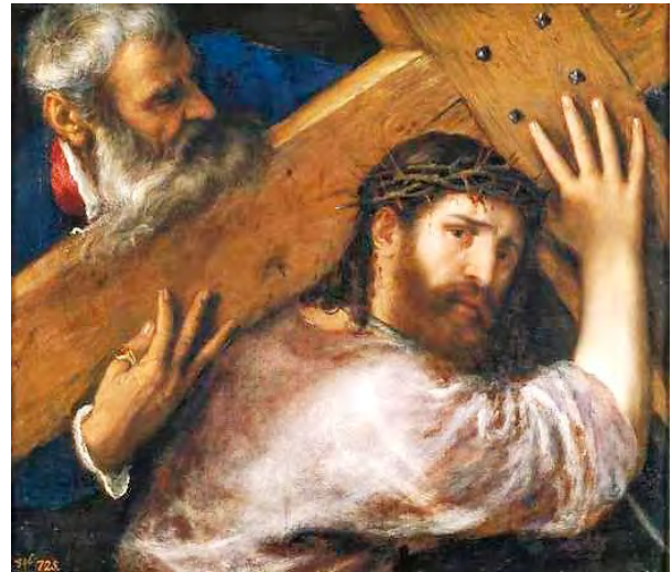
Simon of Cyrene Helps Jesus, Titian c. 1565

The ministry of Jesus had to span at least two years. That means the A.D. 30 date is out. (cont'd)