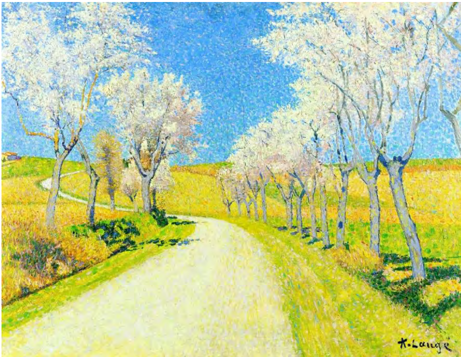
Achille Lauge, French, 1861 - 1944

Adding to and Building up the Kingdom of God