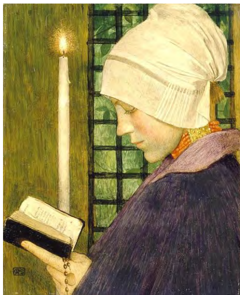
Candlemas Day, Marianne Stokes, Austrian, 1855 - 1927