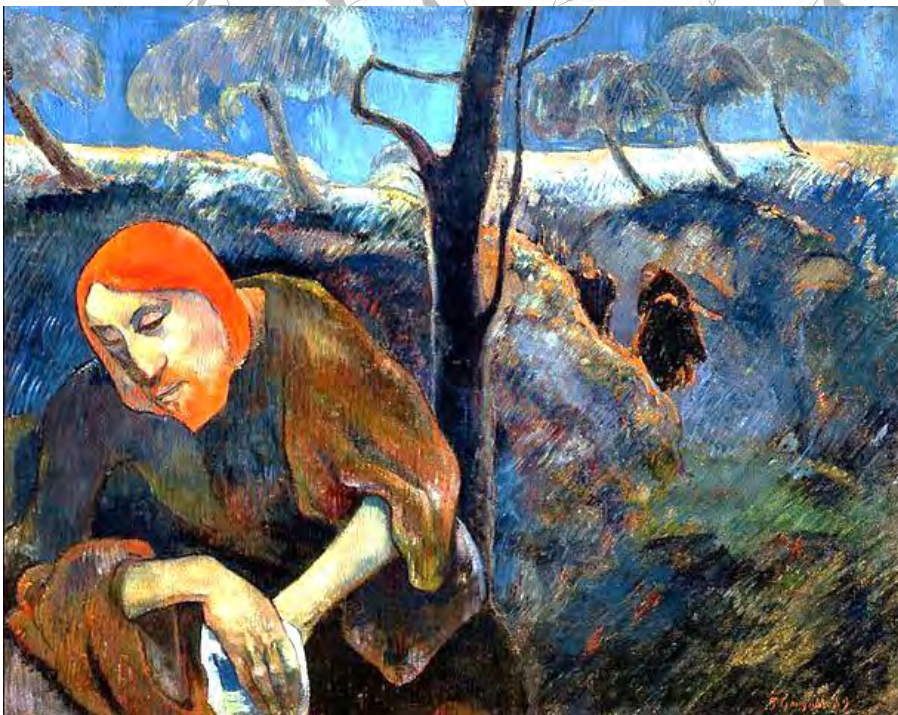
Paul Gauguin, Christ on the Mount of Olives, 1888

www.danbychurch.org office@danbychurch.org https://www.facebook.com/danbychurch