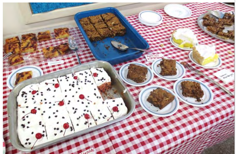
Home-made desserts from the Chicken & Biscuit dinner.

35 For I was hungry and you gave me something to eat, I was thirsty and you gave me something to drink, I was a stranger and you invited me in, 36 I needed clothes and you clothed me, I was sick and you looked after me, I was in prison and you came to visit me.' Matthew 25